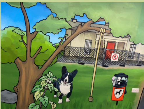
Images of the new pro social behaviour room

Working with volunteers remotely gave Absafe another perspective and exposure to working in new and creative ways. It encouraged Absafe to be more innovative and review their social media platforms to increase the audience for the alcohol education materials. They were able to be flexible in the crisis, supporting young people to understand how alcohol can impact your judgement and actions, which can lead to other risks and dangers. The challenges due to COVID were substantial but overall positive and gave Absafe an opportunity to look at sustainable improvement and implement some 'change' ideas. For example, working flexibly using innovation and young people to lead the teaching of younger people kept the work relevant and focused on the needs of the younger people.